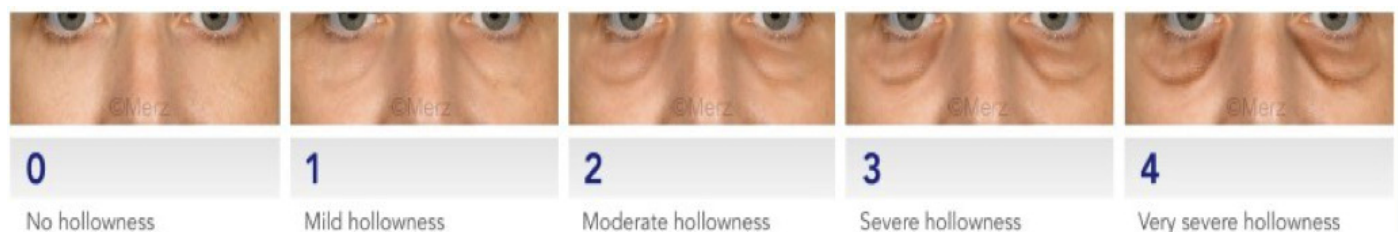
FIGURE 1. Merz Infra-Orbital Hollowness Scale

Sixteen of the original eighteen subjects completed the trial. Two were lost to follow-up. At the start of the trial, one subject classified their under-eye bags as very severe (5), six as severe (4), seven as moderate (3), one as mild (2) and one as very mild (1). When asked to rate the severity of their under-eye bags at the end of the trial using the same system, eleven of the sixteen subjects chose a milder description. The number of subjects who selected each severity rating before and after the